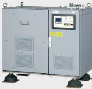
Model: 3396, 27 kVA

to the general requirements of naval ships. The topology of all three inverter types is equivalent.