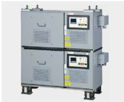
Model: 3397, 2 x 15 kVA