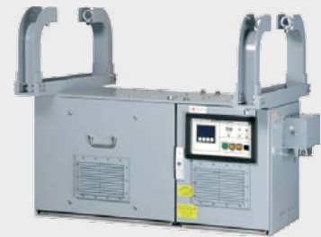
Model: 3398, 7 kVA